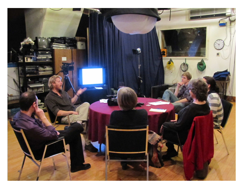
Though the BCTV Studio is busier than ever as a facility for trainings (left) and studio productions (below), it is in need of a major renovation.