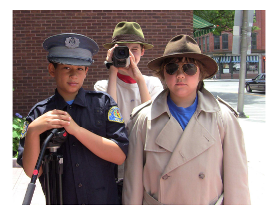
Campers with camera & tripod shooting "Dash Riprock" in downtown Brattleboro this summer.